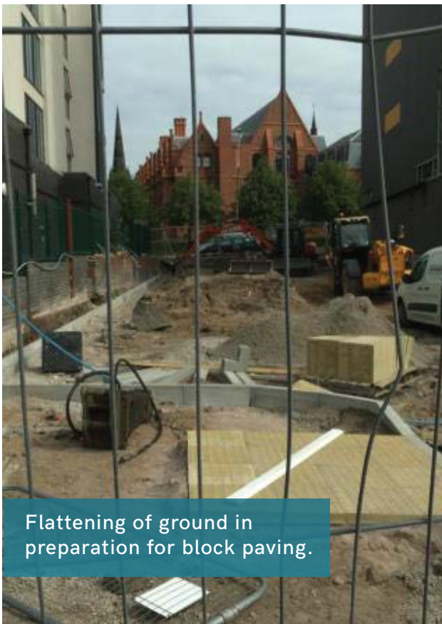
Flattening of ground in preparation for block paving.